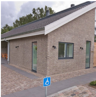
Hareskov Kirkes Menighedshus