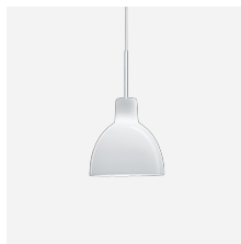
Toldbod 6.1/8.7 Glass Pendant