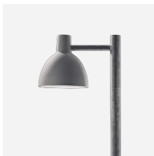
Toldbod 11.4 Post