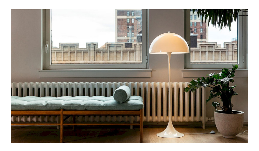
Carl Hansen & Son Showroom