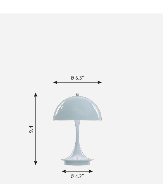
PH 2/1 Portable