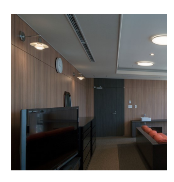
Yokohama College of Dental Care and Health Sciences