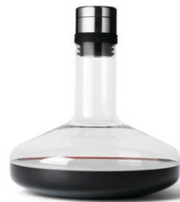
CLEAR / STEEL 4683039