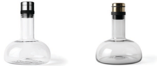
CLEAR / STEEL 4680069