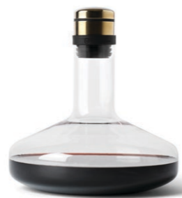
CLEAR / BRASS 4683829