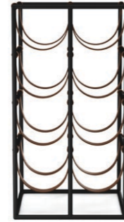
BLACK / COGNAC 4652539

Arthur Umanoff's mid-century modern wine rack combines black powder coated steel with leather for an industrial look. Holding 8 bottles, the reissued design is ideal for wine cellars or as a standalone rack in a kitchen or dining room for keeping bottles within easy reach. The timeless design doubles as a sculptural feature.