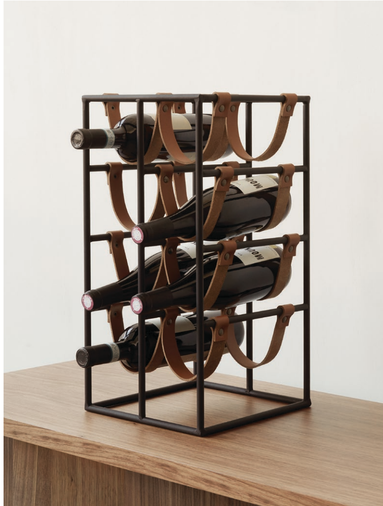
UMANOFF WINE RACK Designed by Arthur Umanoff