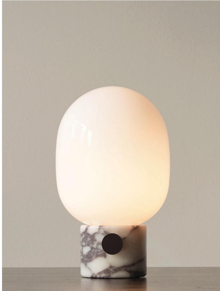
JWDA TABLE LAMP Designed by Jonas Wagell