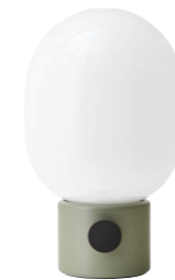
AMMONITE GREY, STEEL 1800089