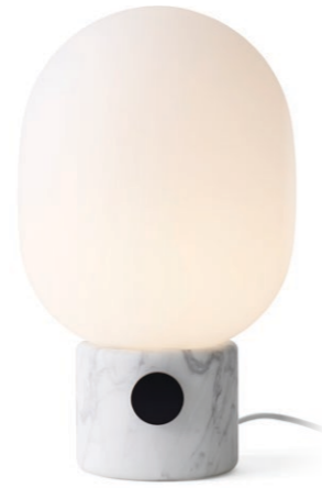
CARRARA MARBLE 1830639

Originally inspired by more archaic oil lamps of the past, the JWDA's form has been simplified into an organic shape that beautifully blends contrasting elements, whereby the raw and delicate harmoniously meet in one. Casting a muted, soft glow, JWDA comes supplied with a G9 frosted bulb, which can be easily adjusted by hand. Its simple silhouette and timeless quality will add a touch of sophistication to the interior, but its functionality and ease of use will ensure that JWDA will become an important part of people's daily lives and do more than just look good.