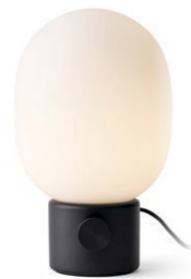
BLACK STEEL 1810539