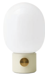
ALABASTER WHITE, STEEL 1800360