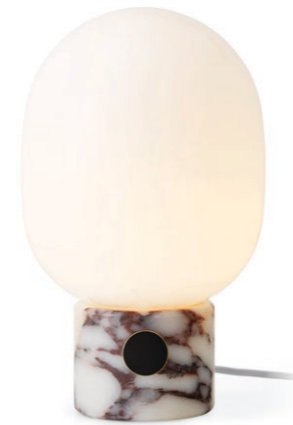
CALACATTA VIOLA MARBLE 1830319