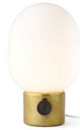
POLISHED BRASS 1800839