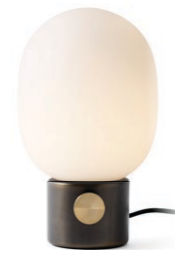
BRONZED BRASS 1800859

Originally inspired by more archaic oil lamps of the past, the JWDA's form has been simplified into an organic shape that beautifully blends contrasting elements, whereby the raw and delicate harmoniously meet in one. Casting a muted, soft glow, JWDA comes supplied with a G9 frosted bulb, which can be easily adjusted by hand. Its simple silhouette and timeless quality will add a touch of sophistication to the interior, but its functionality and ease of use will ensure that JWDA will become an important part of people's daily lives and do more than just look good.