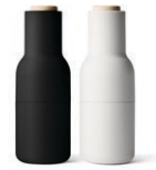
ASH / CARBON 4415399