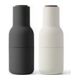
ASH / CARBON 4415369