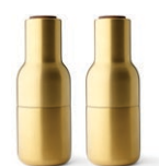
BRUSHED BRASS 4415839