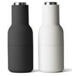
ASH / CARBON 4415599