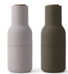
HUNTING GREEN / BEIGE 4415459