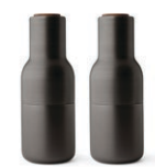
BRONZED BRASS 4415859