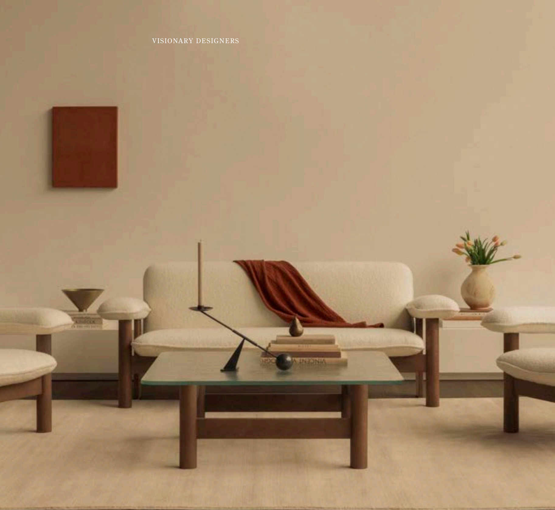
( ABOVE ) Pictured above is the BRASILIA COLLECTION designed by Anderssen & Voll .