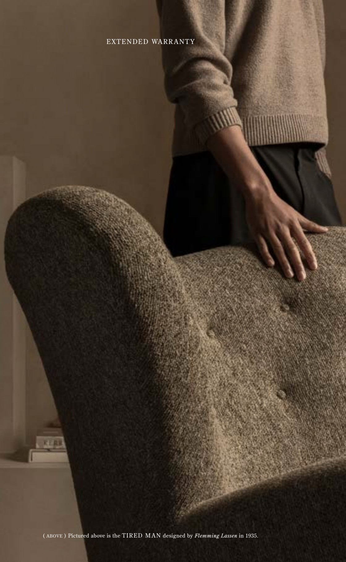
( ABOVE ) Pictured above is the TIRED MAN designed by Flemming Lassen in 1935.