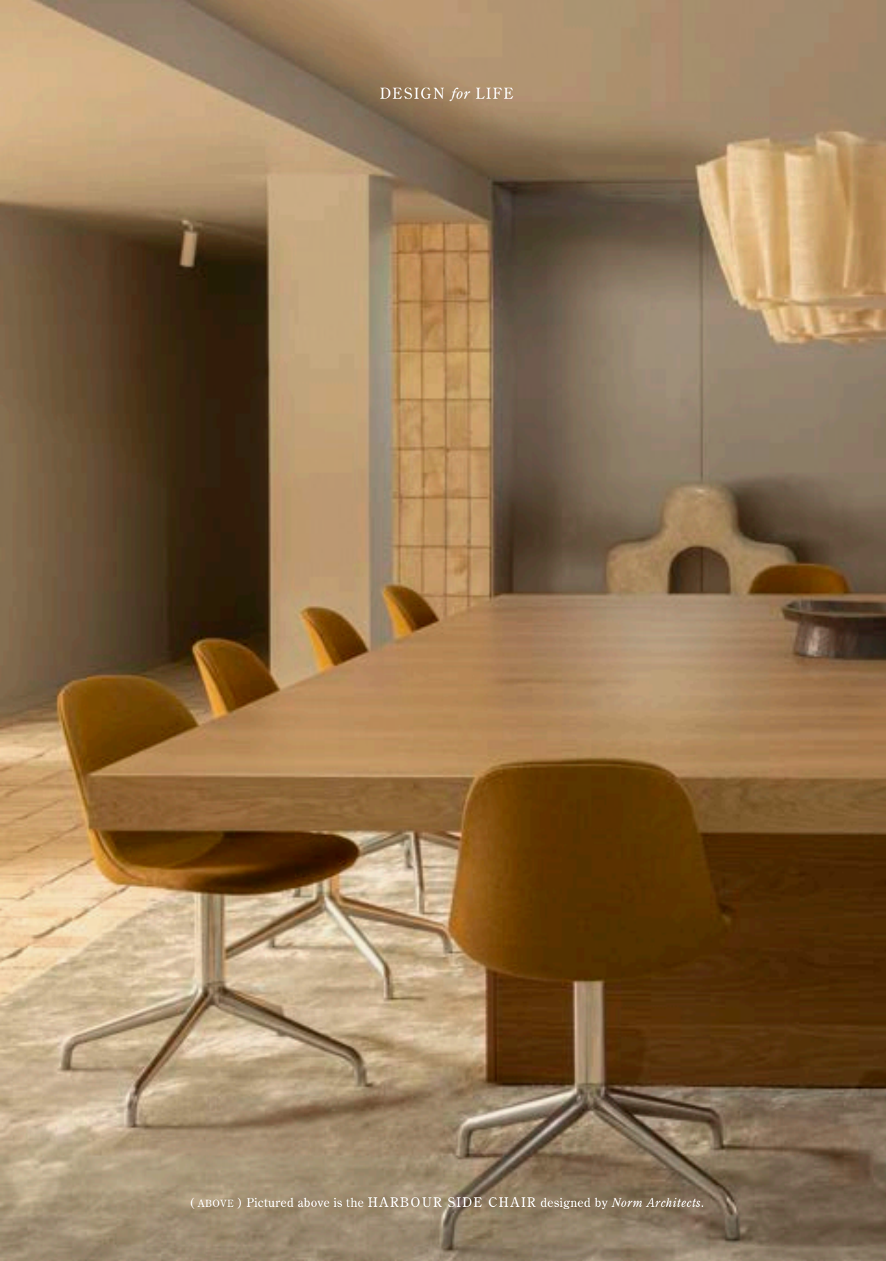
( ABOVE ) Pictured above is the HARBOUR SIDE CHAIR designed by Norm Architects .