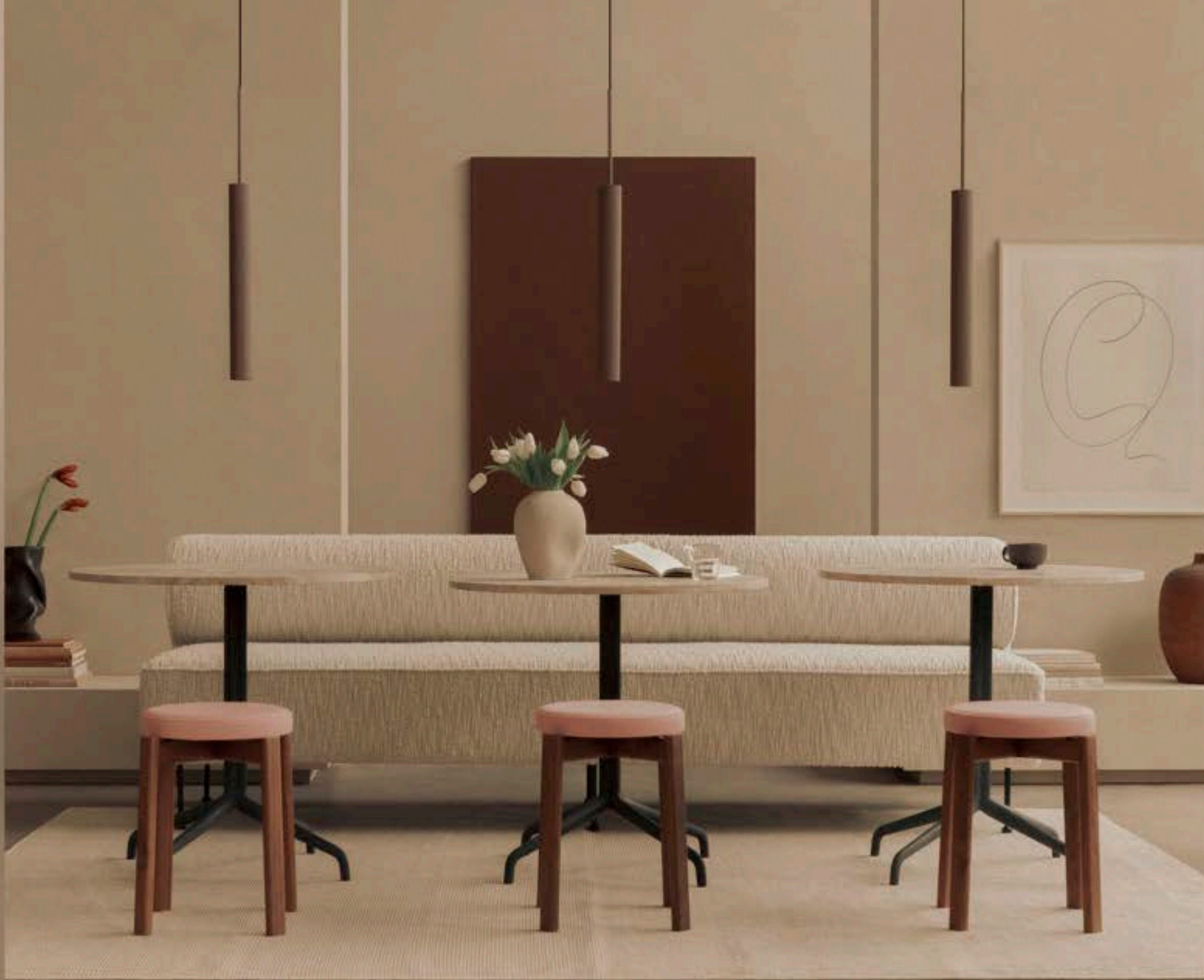
( ABOVE ) Pictured above is the PASSAGE STOOL designed by Krøyer-Sætter-Lassen.