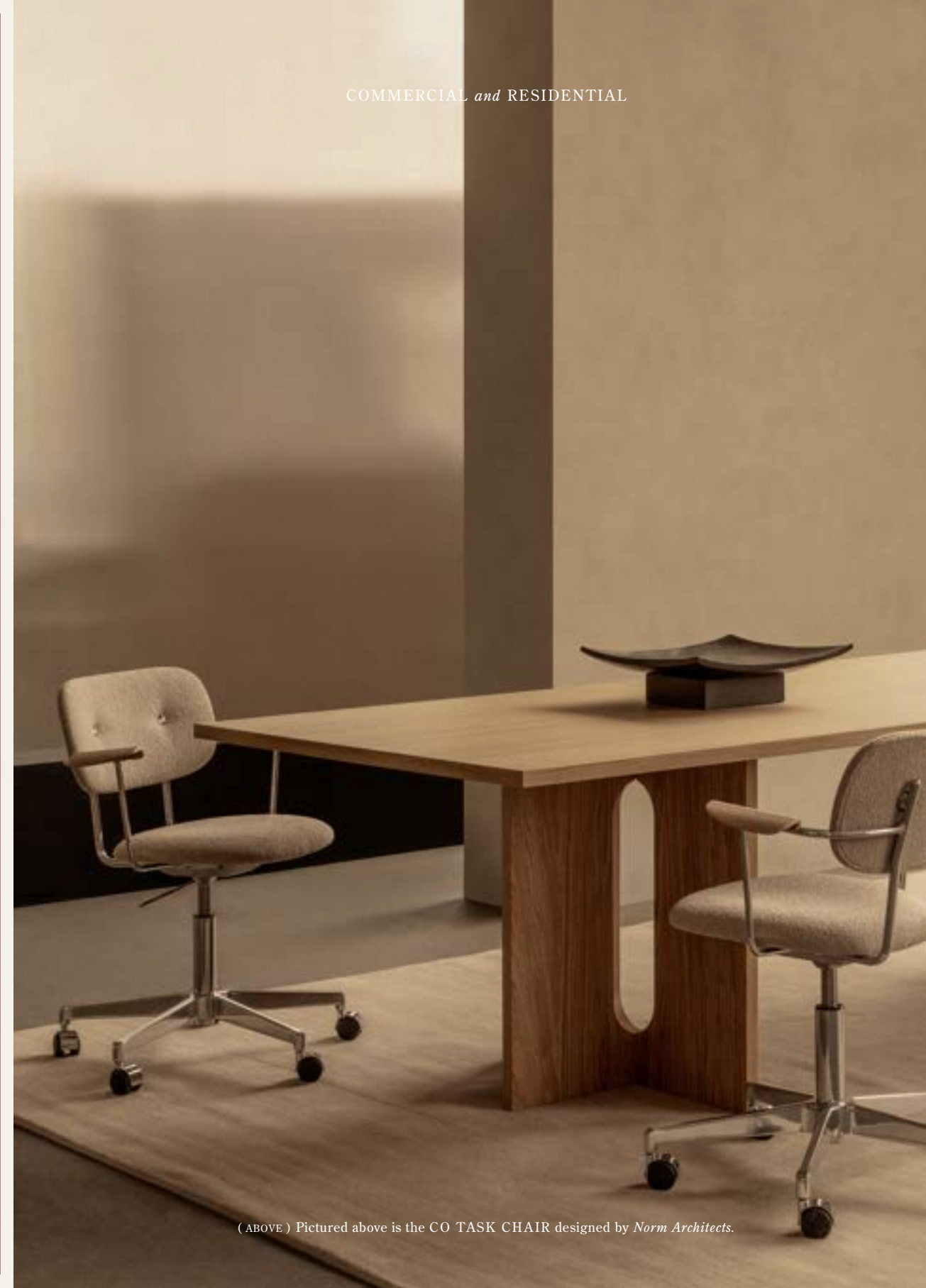
( ABOVE ) Pictured above is the CO TASK CHAIR designed by Norm Architects .

Our collection is thoughtfully curated to cater to the demands of both commercial and residential spaces. This aligns with the growing trend of seamlessly integrating home and work environments, merging comfort and functionality to enhance both relaxation and productivity.